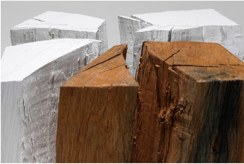
Tony Cragg